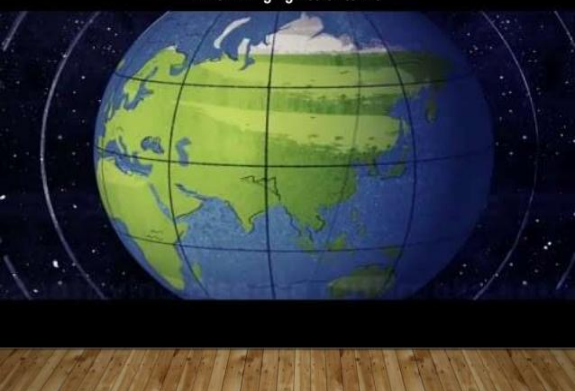
WHO: Bringing health to life