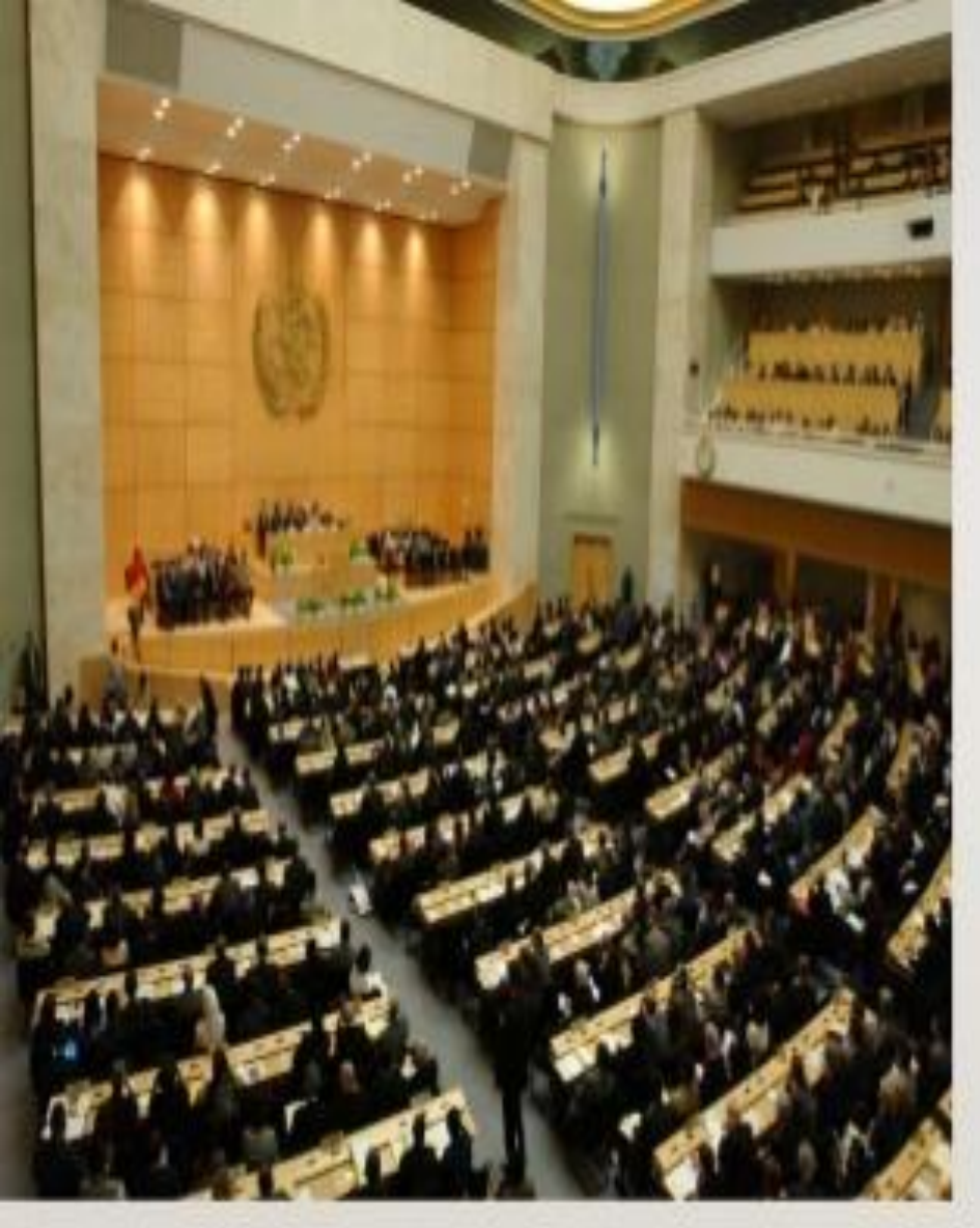
World Health Assembly